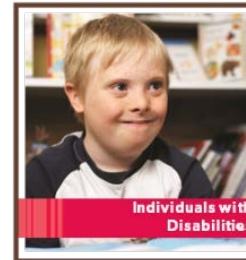
Individuals with Disabilities

1,594 Assists by CARE 7 Victim Advocates