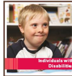
Individuals with Disabilities