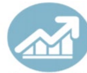
Financial Stability & Vitality